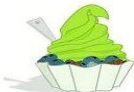
Froyo 20 May'10