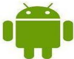
Beta 5 Nov'07