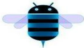
Honeycomb 22 Feb'11