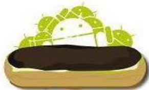
Eclair 26 Oct'09