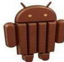
KitKat 31 Oct'13