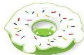
Donut 15 Sep'09