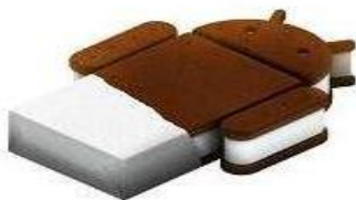
Ice Cream Sandwich 19 Oct'11