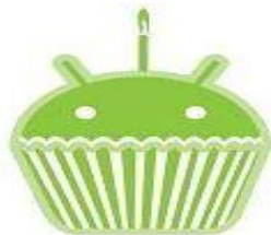
Cupcake 30 Apr'09