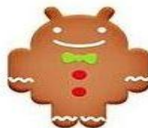
Gingerbread 6 Dec'10