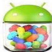
Jelly Bean 9 Jul'12